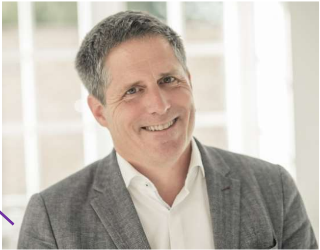
Anthony Browne MP